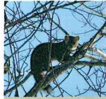
Bear on the farm

Copper-T Ranch is well known for their farm gate sales with their meat being sold at the local corner grocery store, the community market and from the farm. They also sell composted manure for landscaping and gardening.