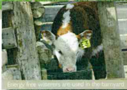
Energy free waterers are used in the barnyard

Cattle graze the hayfields in the fall and are fed forage there throughout the winter, spreading manure across the fields.