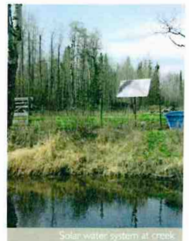
Solar water system at creek