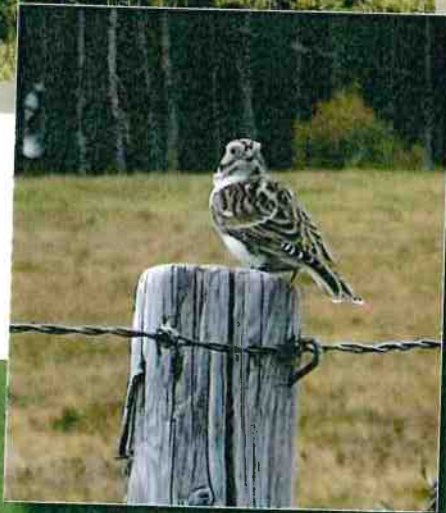
Hawk at the Farm