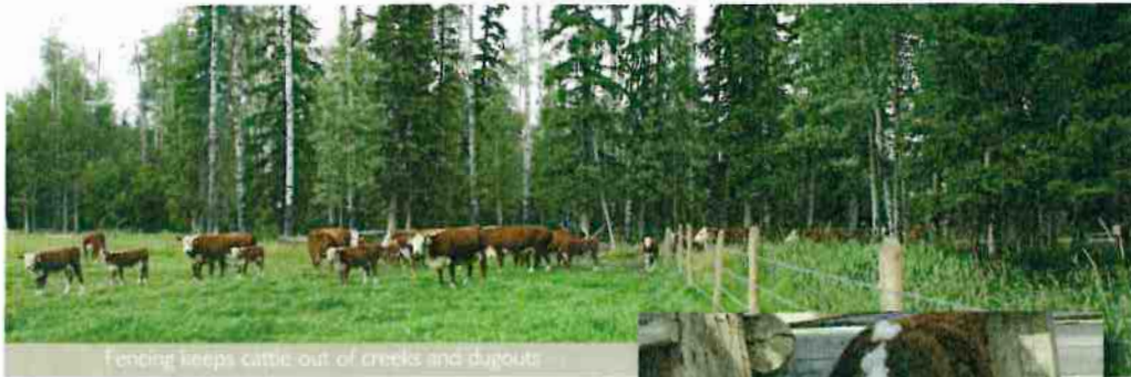
Fencing keeps cattle out of creeks and dugouts