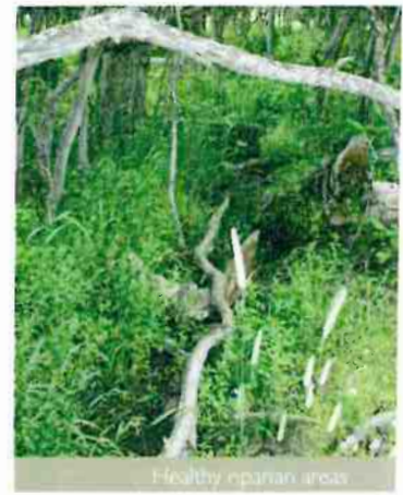
Healthy riparian areas