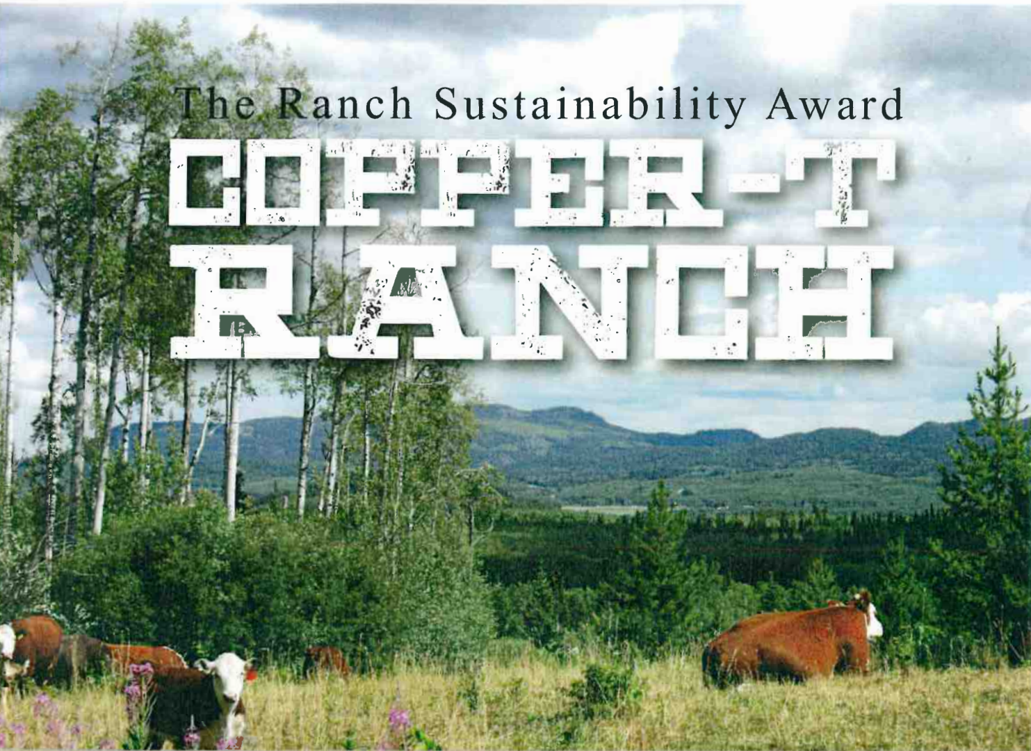
Summer Pasture with a view