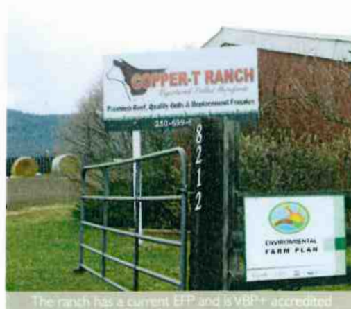
The ranch has a current EFP and is VBP+ accredited