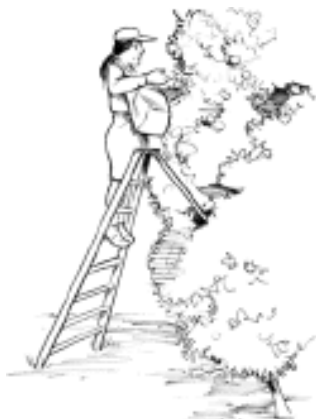
Start picking at top of tree, moving down the tree as container fills