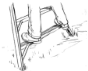
With feet on bottom step, check to ensure ladder is secure