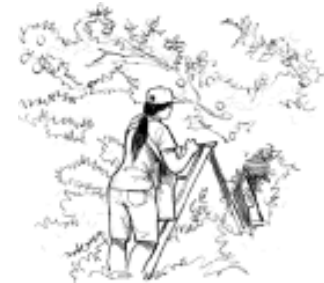
Place ladder for best picking. Move the ladder rather than reach