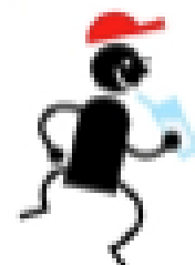
Drink lots of water!