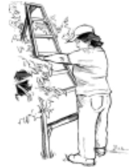
Fully extend hand to ladder to indicate correct angle