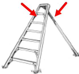
On slopes, keep pole directly up hill at a 90° angle