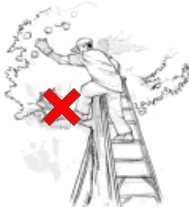
Do not stand on tree branch