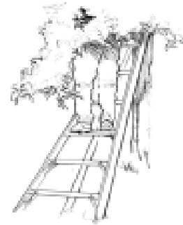
Do not lean ladder on tree